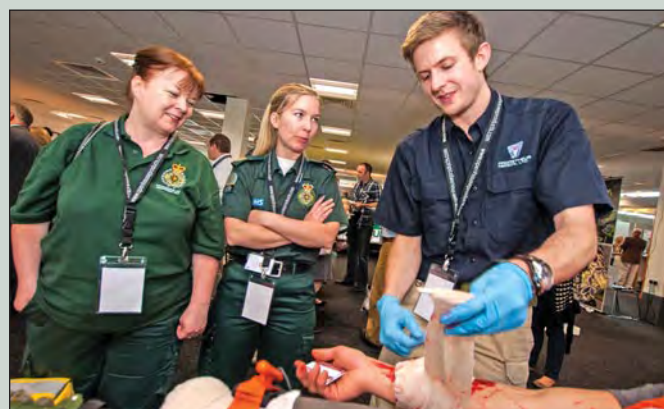
60 suppliers were on hand to show their latest products and services.

AMBITION event. We are already thinking about plans for next year, hopefully to include wider involvement from a range of partner agencies involved in national resilience, so watch this space."